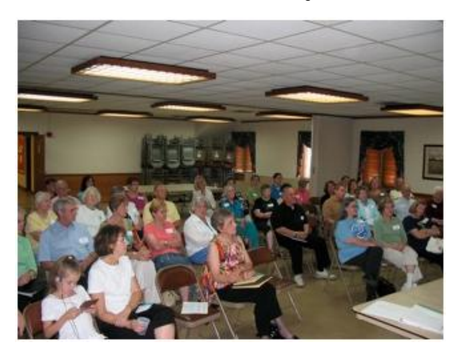
It takes a lot of volunteers to make a free medical clinic work