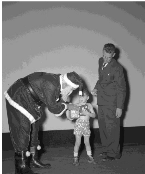
Santa Claus awards one of the fighters with a gift

(As published in The Oak Ridger's Historically Speaking column on December 25, 2013)