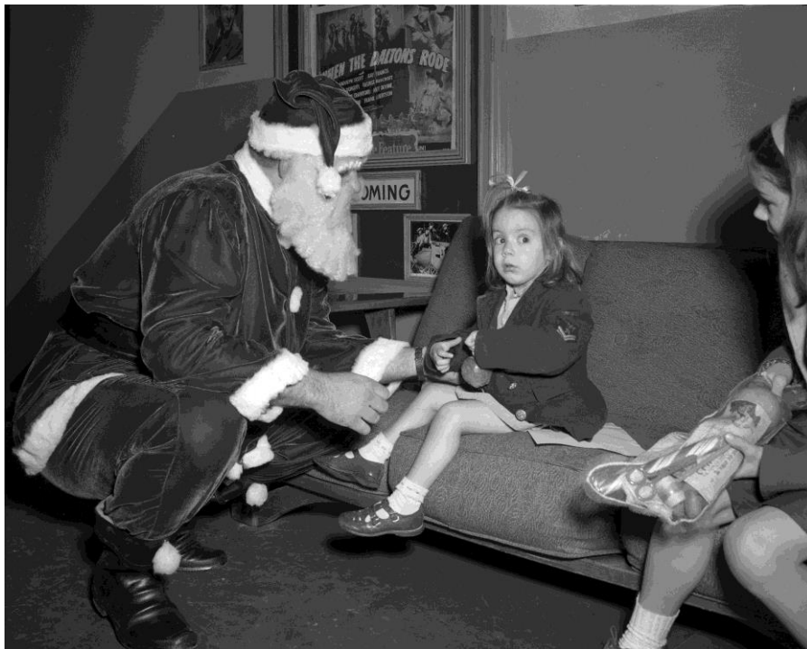
What a great expression on this little girl...