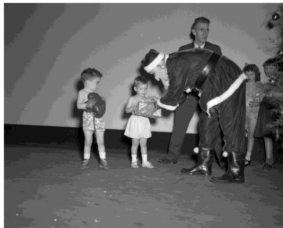
Santa Claus awards the other fighter with a gift