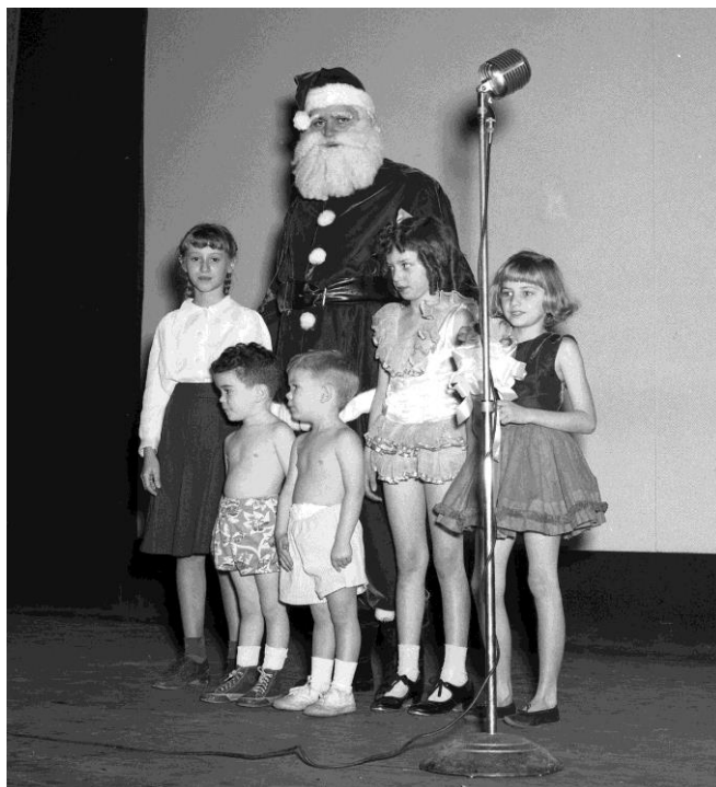
Santa and the entertainers