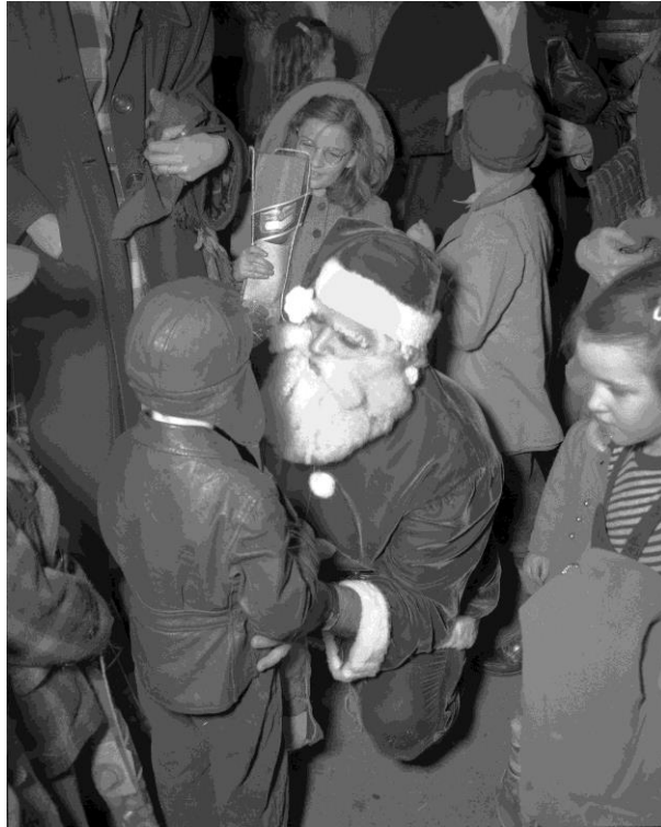
Santa listens to a young boy

(As published in The Oak Ridger's Historically Speaking column on December 25, 2013)